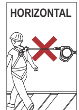
Do not use horizontally.

Steel cable Stainless steel cable of 7x19 and 4.8mm diameter.